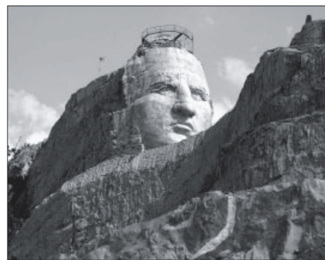
Crazy Horse Monument, Black Hills, SD

When it comes to attire, South Dakota has such unpredictable weather that everyone should be prepared. On the trip to Dead-