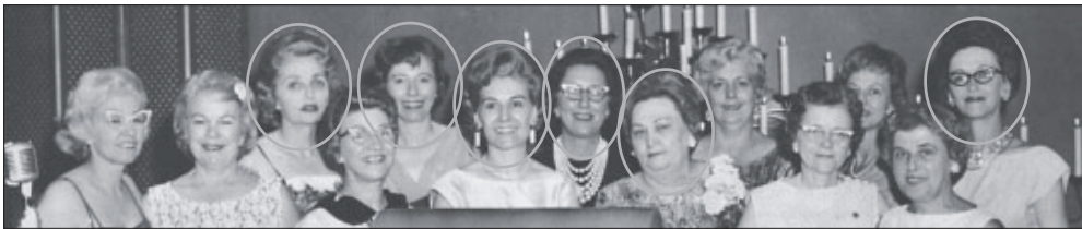
Correct answers to the unsolved puzzle in the mystery photo of the Past Presidents that was published in the January, February, March 2007 NIC Bulletin