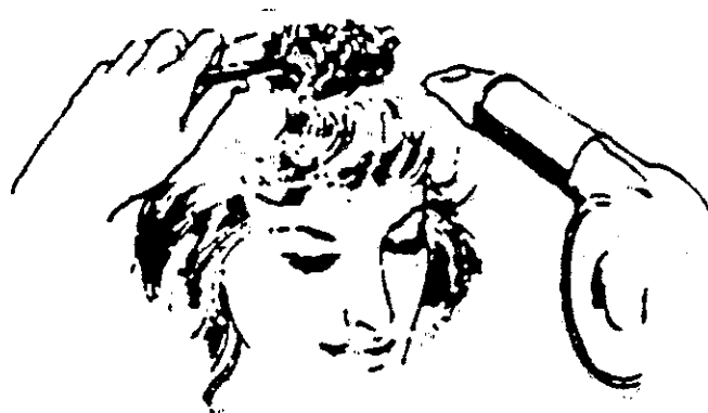
BLOW DRY STYLING