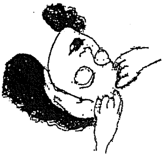
MANUAL EXTRACTION ON THE FOREHEAD