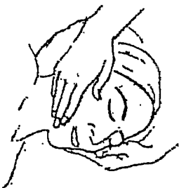
CLEANSING AND STEAMING THE FACE