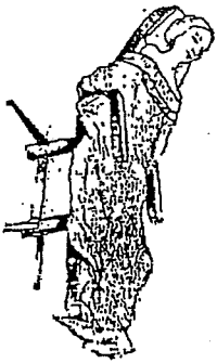
SET UP AND CLIENT PROTECTION