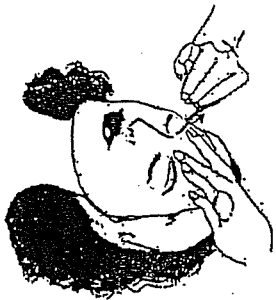
HAIR REMOVAL OF THE EYEBROWS